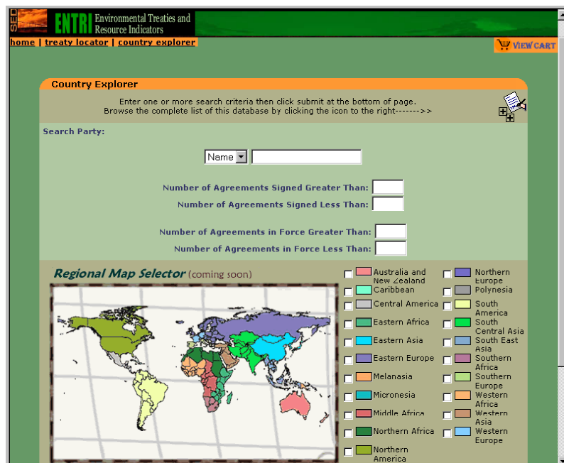
Country Explorer. One of two entry points for accessing treaty information.

enhance access to treaty data and information and to facilitate preliminary analysis. ENTRI's unique system allows users to find status information (i.e., who has signed, ratified or denounced which treaties, and when) for more than 460 environmental treaties. Users can also access full treaty texts and related information easily.