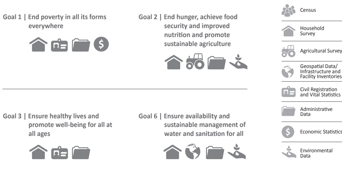
Figure 3: Examples of SDGs and their monitoring tools.

Resources should also be more effectively coordinated. Donors should ease countries' access to funding by creating a new funding stream to support the data revolution for development. Donors are increasingly aligning their contributions with NSDSs, which highlight key priority investments. To ensure maximum coordination and coherence, this funding stream could be a multi-donor trust fund, administered by the World Bank but governed by a broad range of stakeholders, including the UN. This fund should also